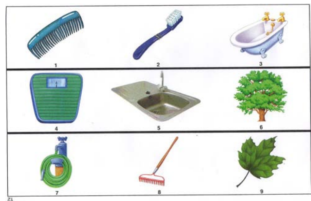
Fig. 1 Example trial from the Picture Concept Task. The subject has to identify the common association between one item from each row